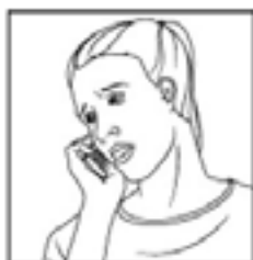
CALL Dial 111

CPR: Start CPR: 30 chest compressions; two breaths