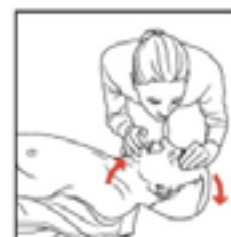
Give two breaths. Continue with 30 pumps and two breaths until help arrives