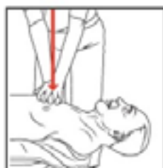
Firmly push down five centimetres on the chest 30 times